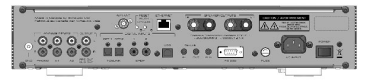
Figure 2: Neo ACE Rear panel

Everything about Ace is straight forward and I found the MiND app to be easy and intuitive to use. The app supports Tidal, Deezer, and Qobuz streaming, and makes the initial set up a simple process; open the app, it finds Ace, you tell it where your music is stored, log in to your streaming account(s), and you are off to the races. Playing your music is also easy and intuitive although I find Roon to be...better.