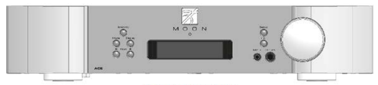
Figure 1: Neo ACE Front panel